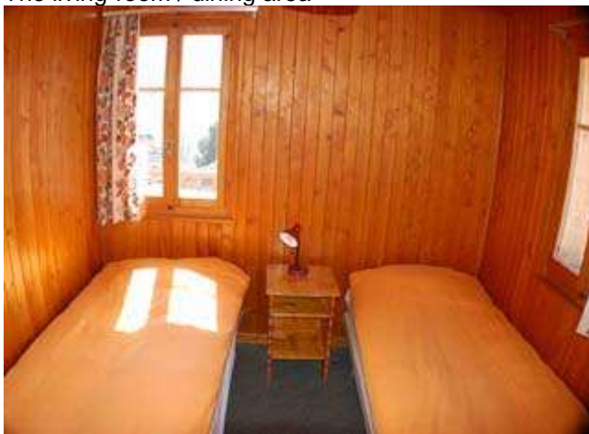
Two-bed room (B)