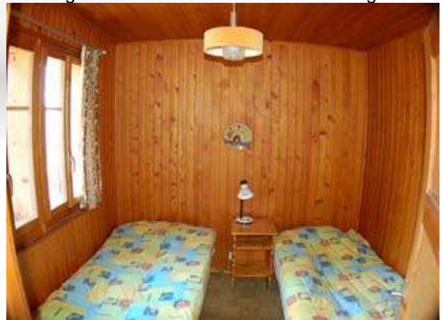
Two-bed room (A)