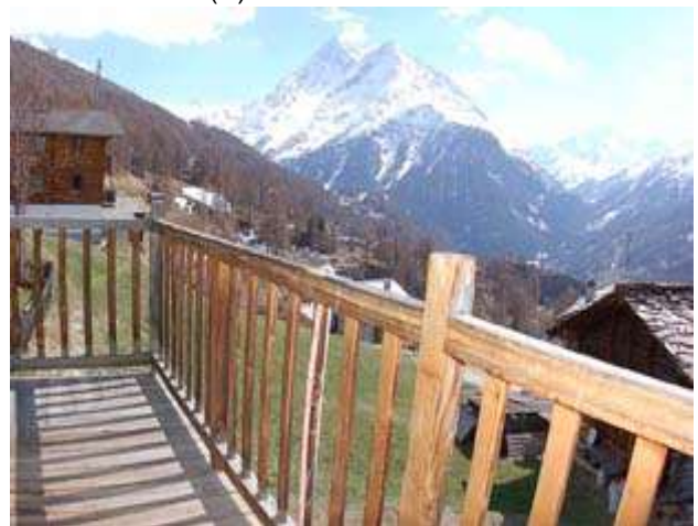
View from the balcony (Dents de Veisivi and Pigne)