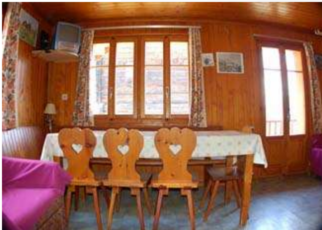
The living-room / dining area