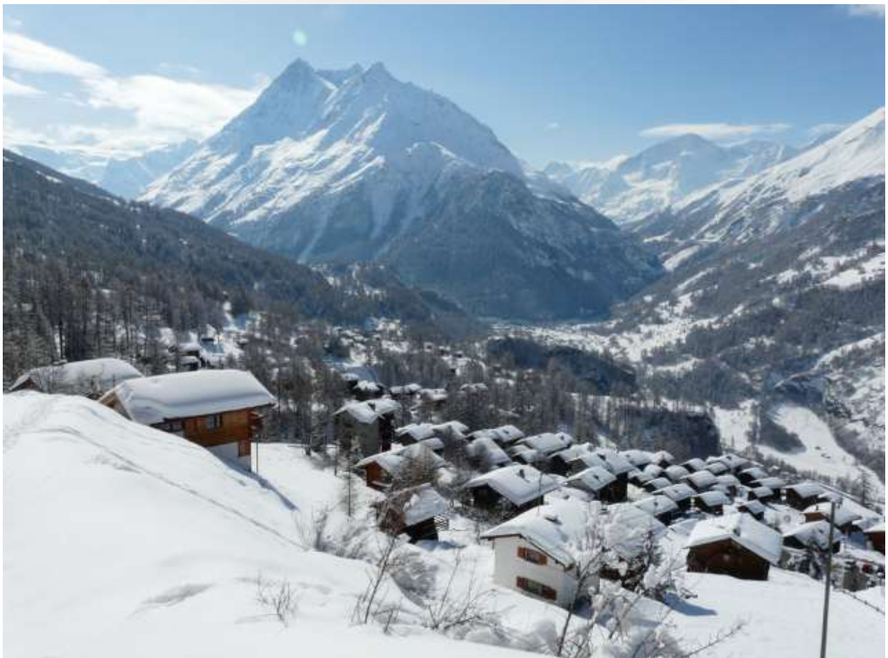
Villaz bathed by the sun, with a view (from left to right) of the Dents de Veisivi and the Pigne d'Arolla.

Villaz has 80 inhabitants who essentially live off agriculture and tourism. Why not come and discover Villaz for yourself? Whether you opt for a weekend break or a longer holiday, the Gaudin family offers charming and functional accommodations: holiday apartments, bed and breakfast or Alpine chalets. .