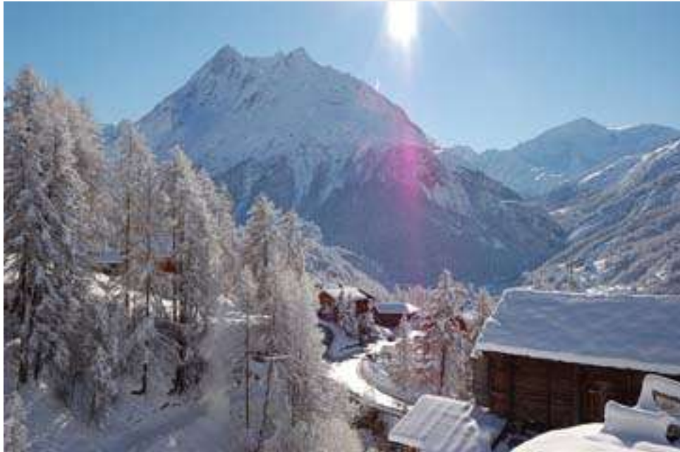
The house viewed from above. Les Dents de Veisivi and the Pigne d'Arolla can be seen in the background