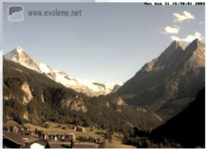
View from the balcony (webcam)