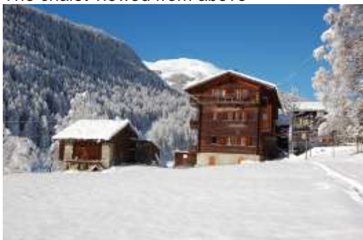
Frontal view of the chalet