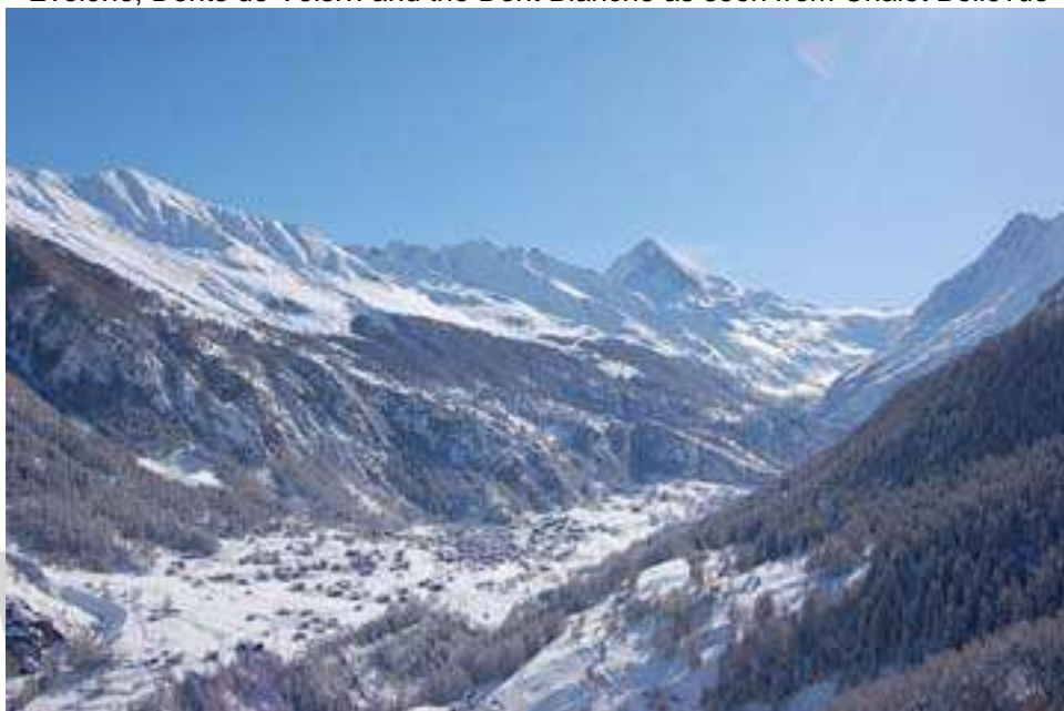
Evolène during the winter, view from the skislopes