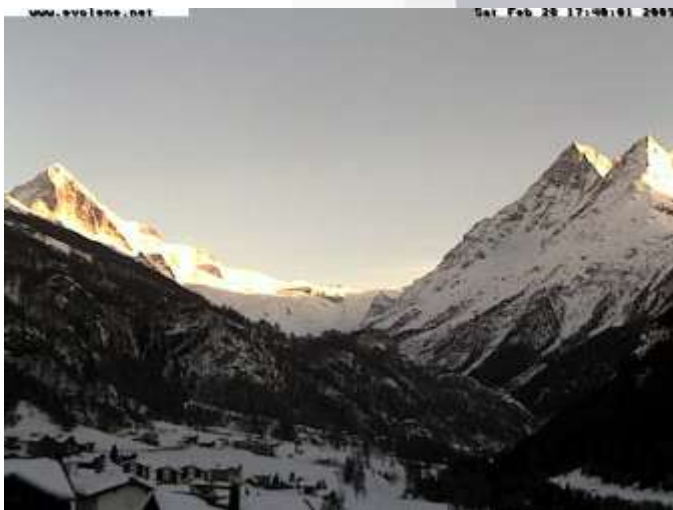
View from the balcony (webcam)