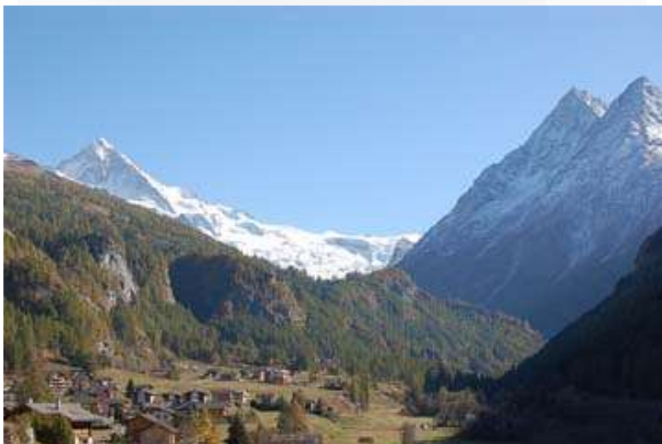
Evolène, Dents de Veisivi and the Dent Blanche as seen from Chalet Bellevue

In the winter, the region of Evolène offers its visitors an awe-inspiring panorama and more than 100 km of outstanding ski slopes. In the direct vicinity of the region of Evolène, visitors can enjoy pleasant snowshoe walks, whilst the more adventurous may like to go heliskiing in the company of a mountain guide.