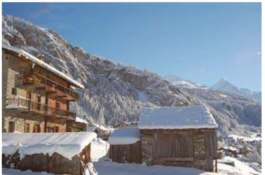
The chalet viewed from below