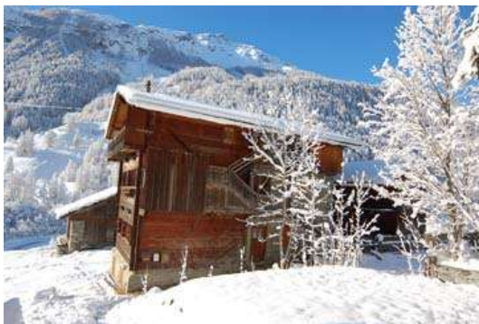
The chalet viewed from above

Balcony with a magnificent view, fully south-facing: see the live webcam on the website